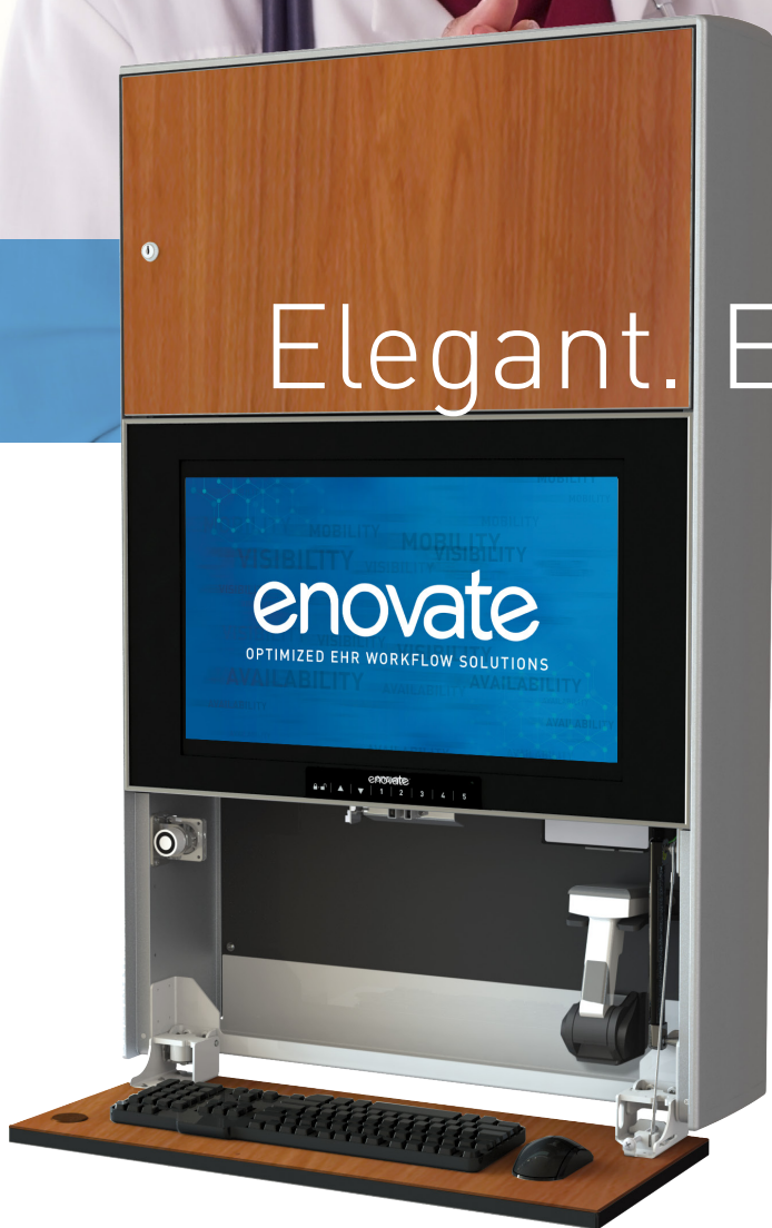
e750 Barcode WallStation with eSensor