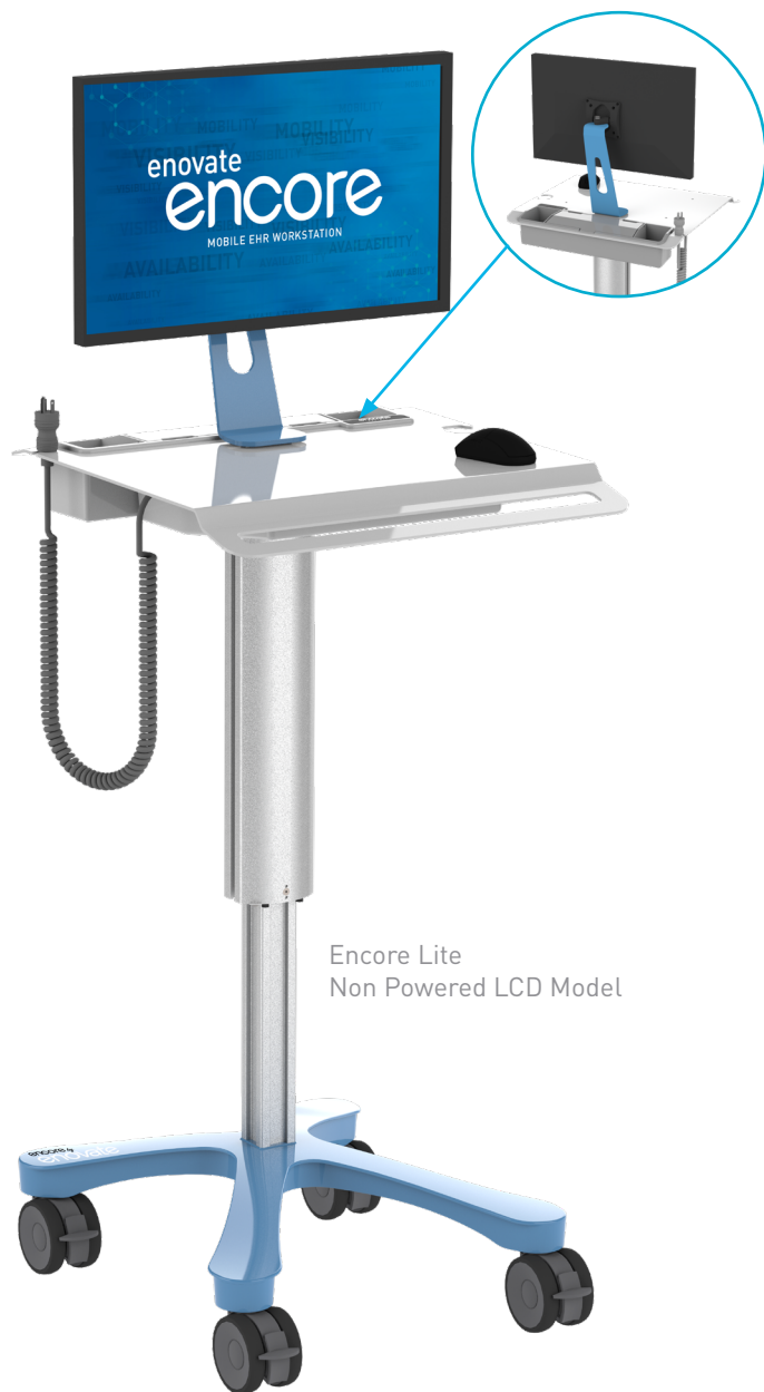
Encore Lite Non Powered LCD Model