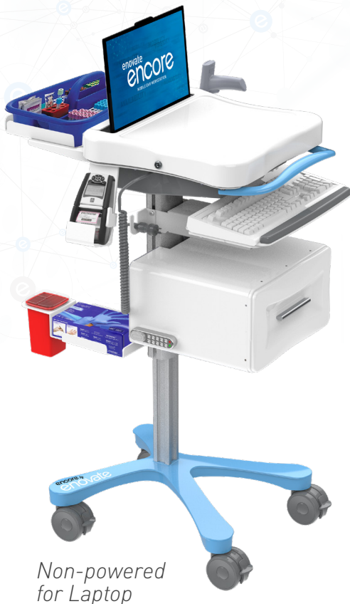
Non-powered for Laptop

Increase collection turnaround times and improve productivity for lower operational costs by giving phlebotomists what they need all on one lightweight mobile EHR workstation