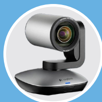
High Resolution PTZ Cameras

OUR TELEHEALTH CONFIGURATIONS SUPPORT TELECONFERENCING & DIAGNOSTIC PERIPHERALS