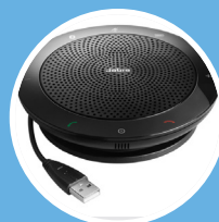
Speakers and Microphones