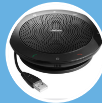
Speakers and Microphones